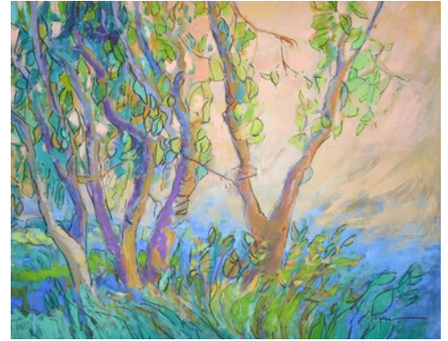
Goddess Stepping Out

Dorothy Fagan is one of the most respected artists in Tidewater and we are excited and pleased to have her as our featured artist at the start of the fall season. "Dorothy Fagan: Goddess Stepping out" will open on September 7 and be on display until October 20, 2018. The show will feature some of her work of Italian scenes created over the past couple years.